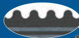
Orthopedic 4-ply, cushioned treadbelt 5X magnification