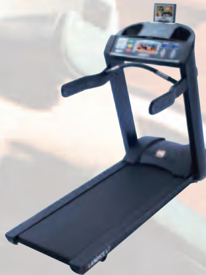
L7 shown in Matte Textured Black