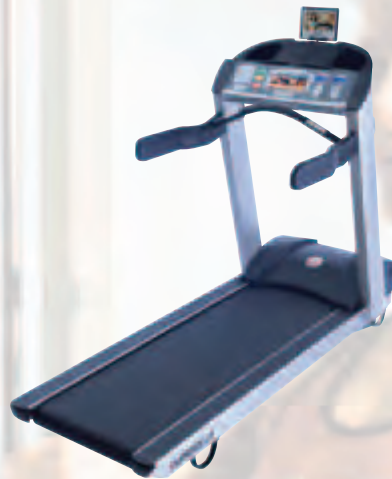
L9 shown in Titanium